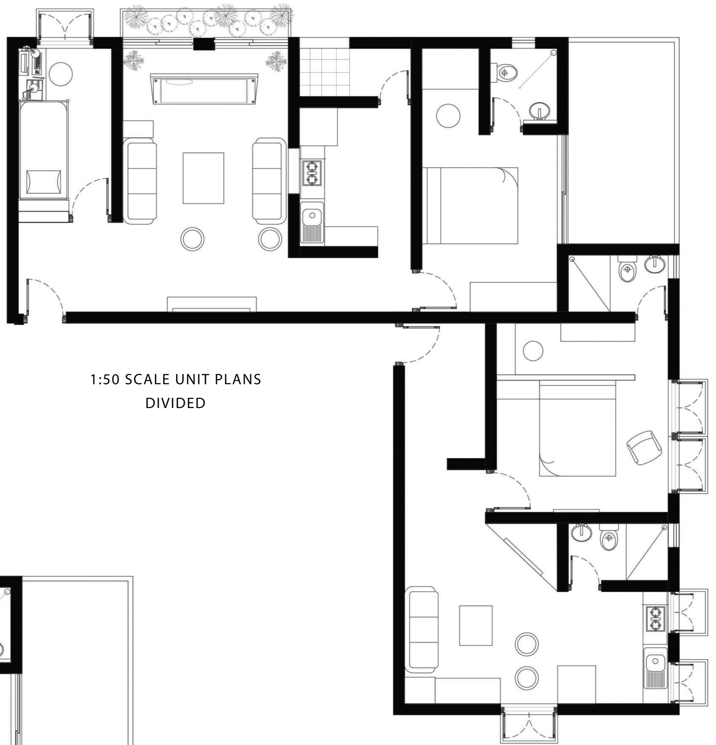
1:50 SCALE UNIT PLANS DIVIDED