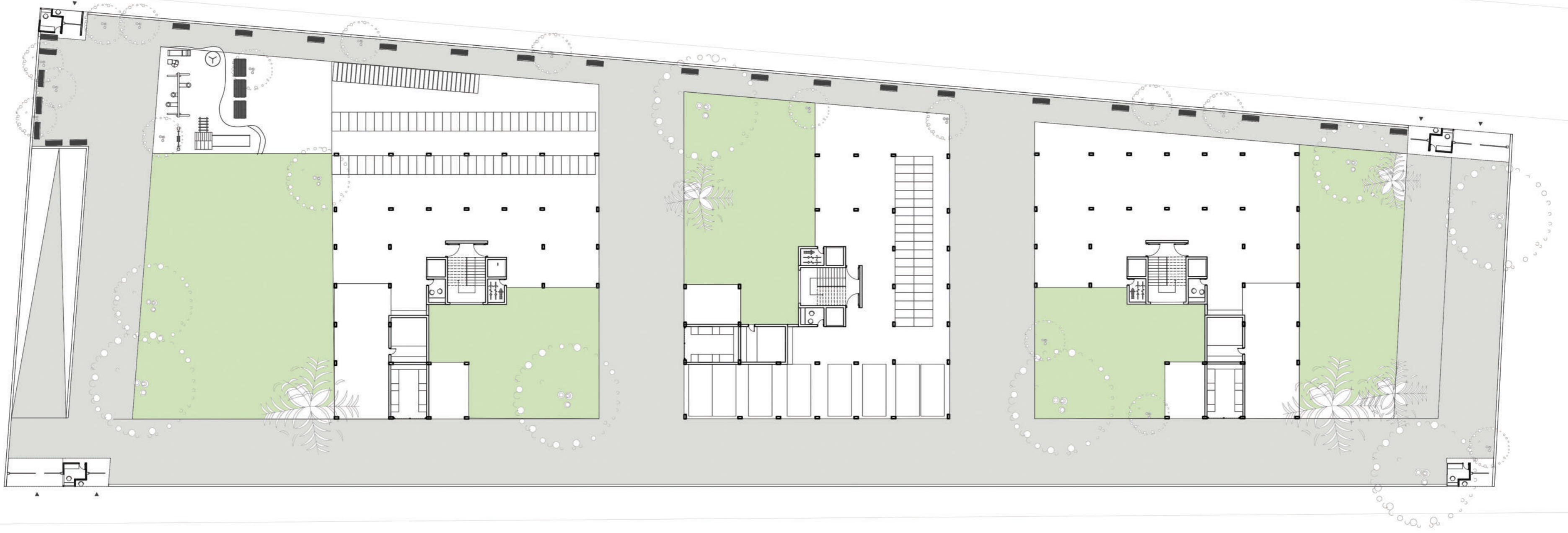
1:250 SCALE SITE PLAN