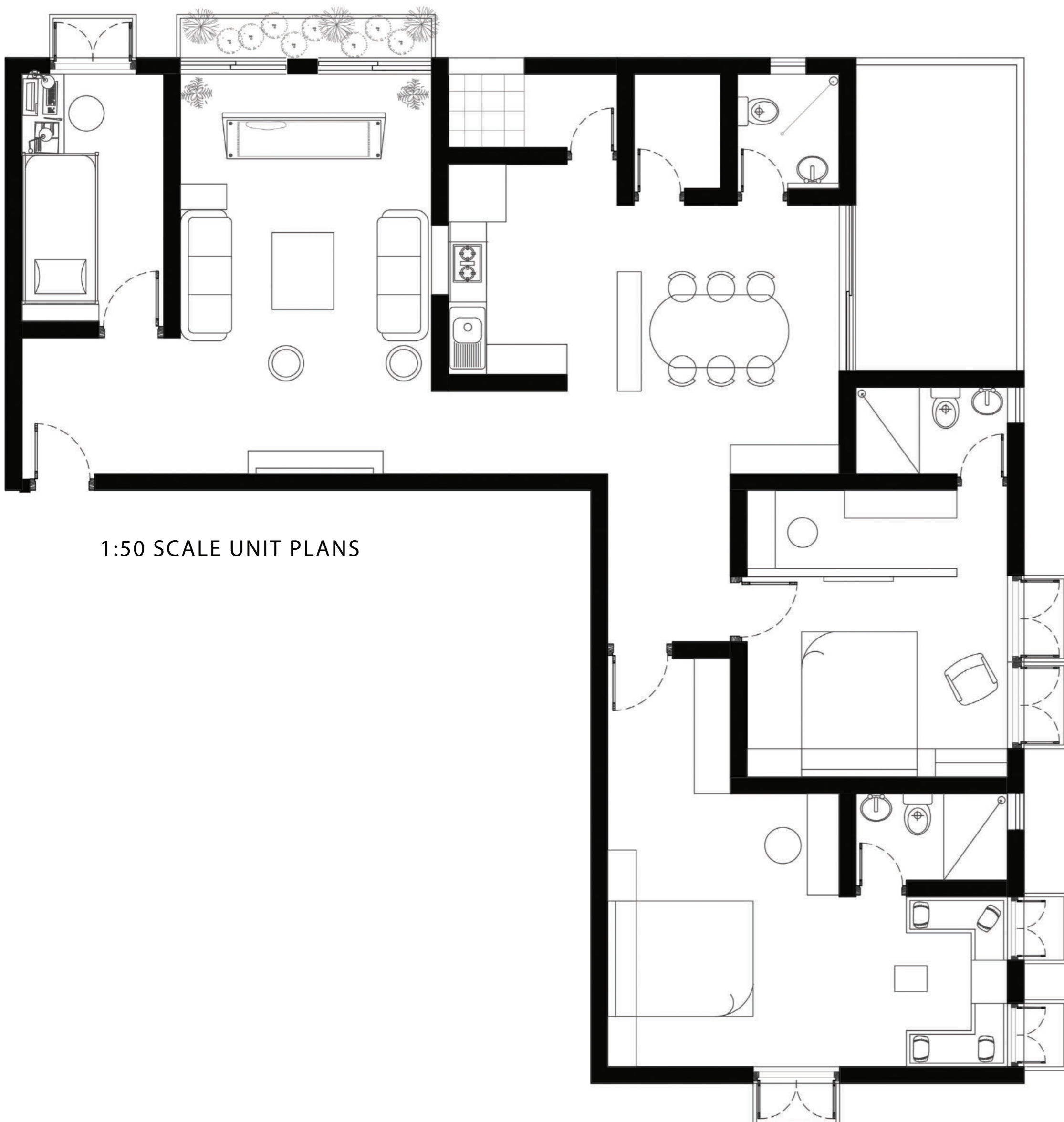
1:50 SCALE UNIT PLANS