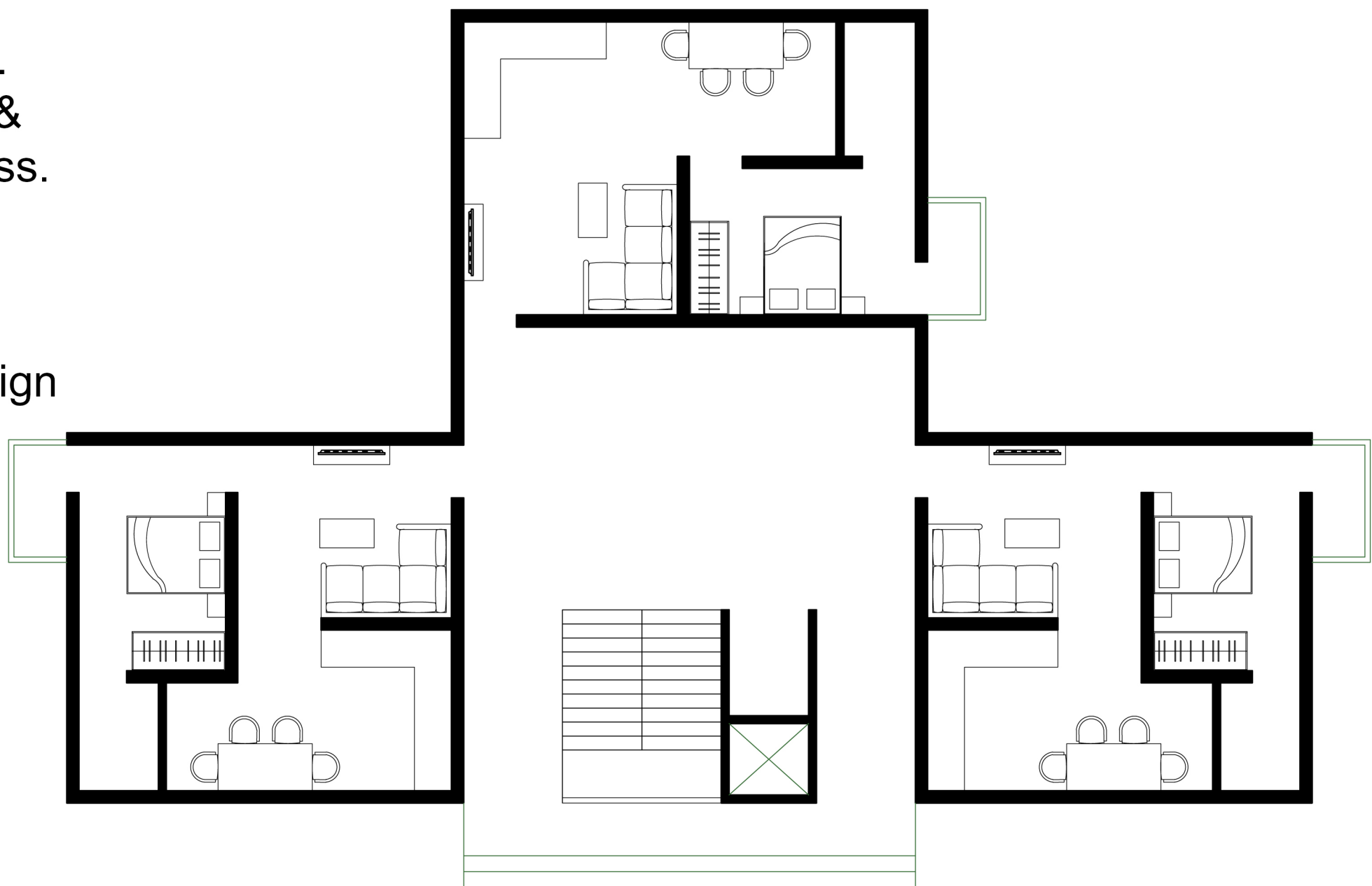
Unit plan 1:100 scale