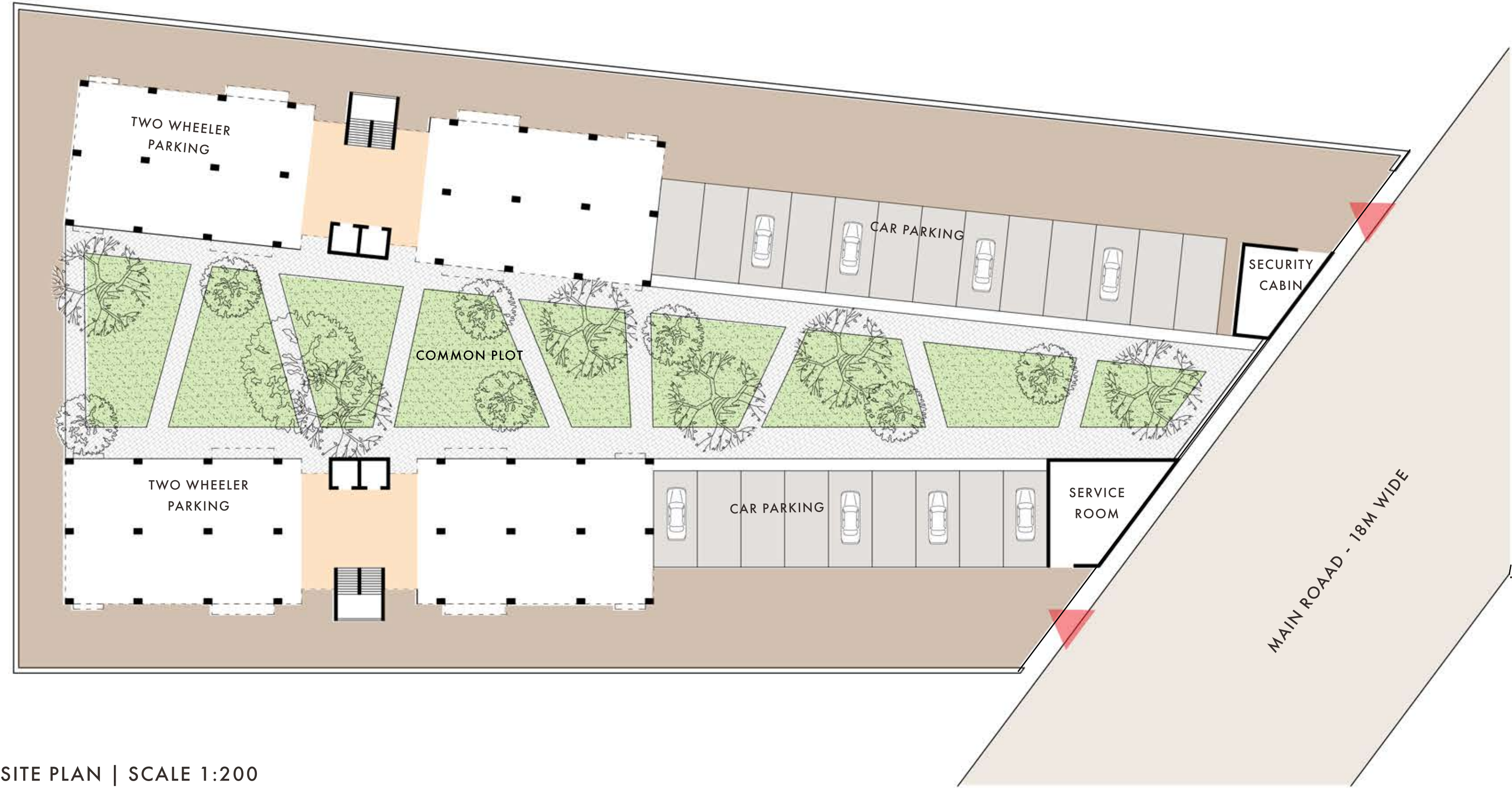
SITE PLAN | SCALE 1:200

These units are imagined to be occupied primarily by the working nuclear families. The desires or expectations of home of the user group were given a thought as the first step of the design process. The house is occupied only in the evening till morning and on Sundays in this case. Hence some ideas of shared resources and programs have been introduced accordingly. A shared laundry room, as there is not enough space in this unit size and no time with the families to maintain individual laundry equipments. The ground floor is planned to be developed as a public plaza, in which spaces can be sold for following comercial purposes, as per GDCR. A small scale supermart at the ground floor as there is no such facility in the vicinity, and predicting future developments, this will also be used by the upcoming resedential units. A small creche\children's library, which will be very helpful for the working parents. A small caffee\co-working space for the young working individuals who might also reside in these unit and the upcoming housing units in the surrounding.