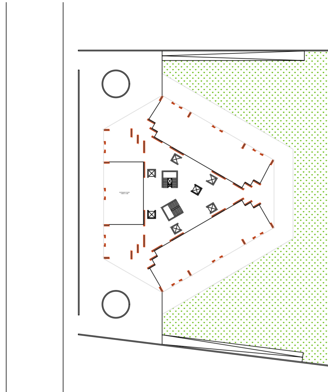
Ground Floor plan / 750 scale