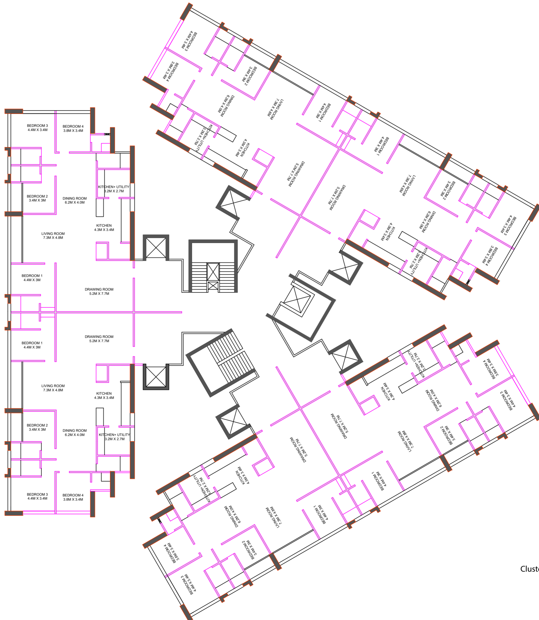
Cluster Typical Floor plan / 200 scale